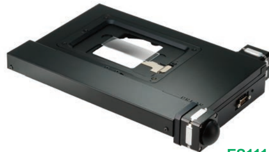
ES111 For Upright Microscopes

OptiScan™III stages are ideally suited to a wide range of imaging applications. A wide range is available to fit most inverted and upright microscopes, and are compatible with the full range of Prior specimen holders; so examination of glass slides, multiwell plates, Petri dishes and metallurgical specimens is possible. Thanks to a unique S-curve acceleration algorithm, movement and positioning is smooth and without vibration.